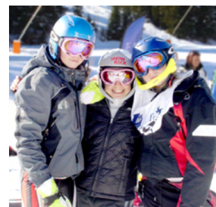
New SPSRC Schoolgirls Team